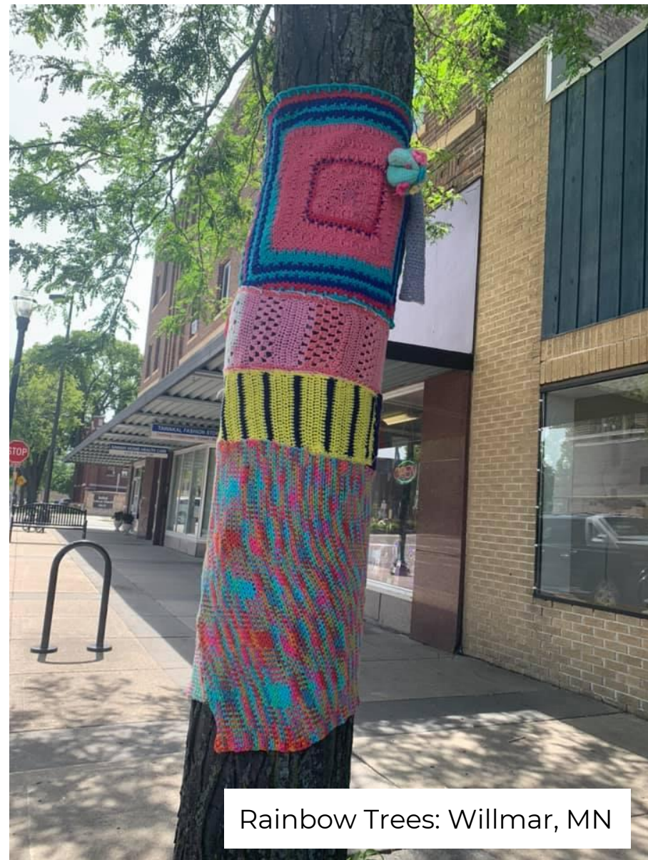
Rainbow Trees: Willmar, MN