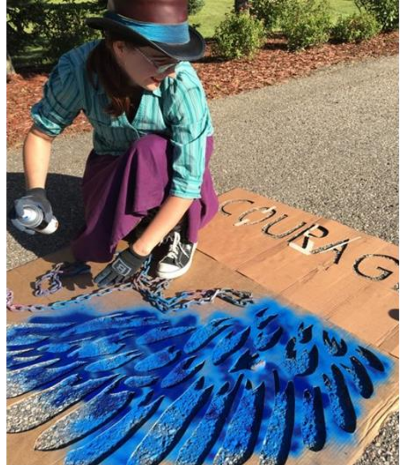
Sidewalk Surprise: Faribault, MN