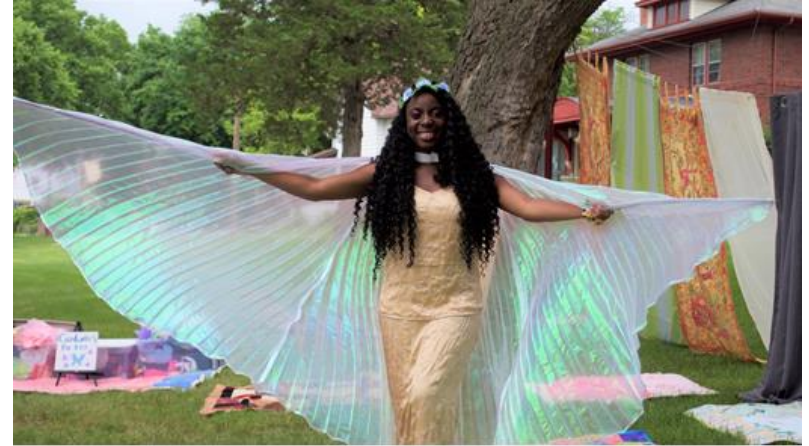
Outdoor Shakespeare: Mankato, MN

Artist-led community development that builds reciprocal relationships, cross-sector partnerships, and asks what else is possible.