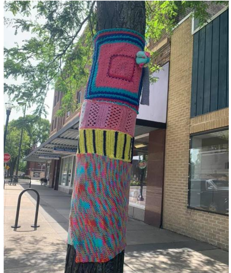
Rainbow Trees: Willmar, MN