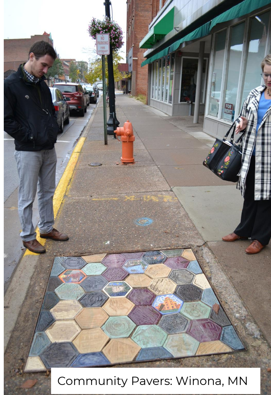
Community Pavers: Winona, MN