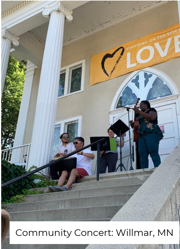
Community Concert: Willmar, MN