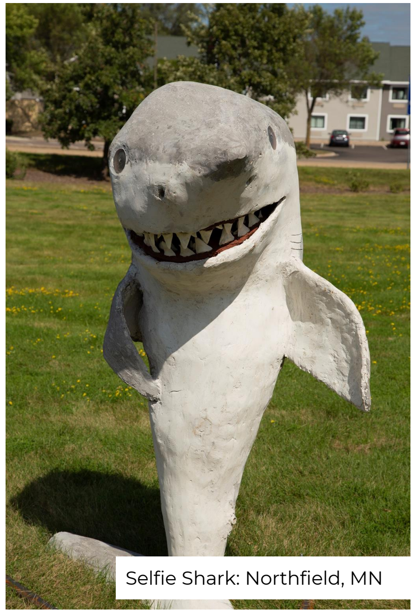
Selfie Shark: Northfield, MN

Main Street is an asset-based economic development program that leverages existing assets to develop a thriving and active downtown.