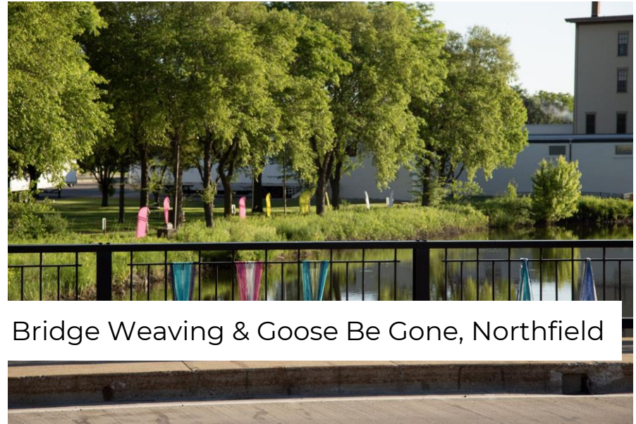
Bridge Weaving & Goose Be Gone, Northfield