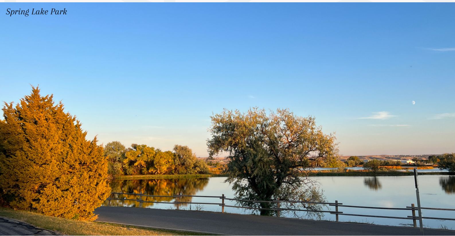
Spring Lake Park

Williston has a long trail that goes from Spring Lake Park all the way to the 1804 bypass. This trail is great for long runs or bike rides.